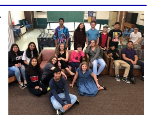
Will you help us?

No experience necessary; only an interest in supporting the youth of the congregation.