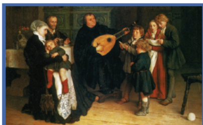
Luther singing with family and friends

Situated within the wider narrative of Christian worship, the story of Lutheran music begins with Martin Luther's own gifts as a lutenist and composer. Unlike Calvin and Zwingli, who appreciated music but distrusted its emotional appeal, Luther did not want to restrict ways in which God's gifts of language and music were used in worship. In a passage that recalls the parade of voices and instruments in Psalm 150, Luther wrote that praise should "sound forth with joy" from "organs, symphonias, virginals, regals, and whatever other beloved instruments there are."