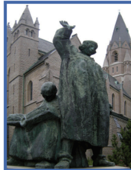
Statue of Olavus and Laurentius Petri

In Sweden , two brothers, Olavus and Laurentius Petri, spearheaded the Reformation. Both had studied theology with Luther in Wittenberg. They returned to Sweden around the same time King Gustav I Vasa was creating an independent nation. He made Olavus pastor of the city church in Stockholm, where he translated the New Testament into Swedish, created a catechism, published an order of worship, and provided a Swedish hymnal. Meanwhile his younger brother, Laurentius, was made the first Lutheran archbishop of Sweden; he and Olavus jointly produced a complete Bible in Swedish.